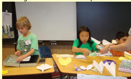
3 rd grade business: The Paper Place

On May seventh, the third graders started our unit on economics. During this unit we started our own businesses. First, we chose our business partners. Then, we decided what to sell. Some of the products are Frisbees, decorated pencils, serenity rocks, and splatter stationary. Next, we got together with our partners over the weekends and after school and made our products. Lastly, we sold our products to kindergartners through fourth graders and our parents! We looked forward to opening day and each business day!!