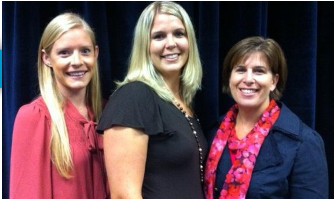
Meadow Park's 6 th Grade Team