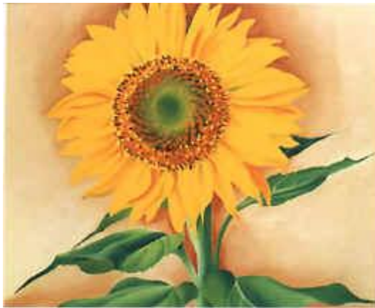
Georgia O'Keeffe's A Sunflower From Maggie . MFA. Prints available at many Art Print poster shops. See more Georgia O'Keeffe Sunflower Prints online. Compare to Vincent Van Gogh's Sunflowers