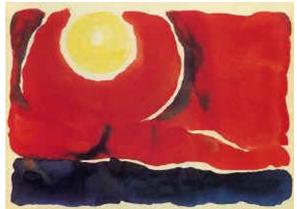
Georgia O'Keeffe Evening Star No. VI - 1917 watercolor 23x31cm Georgia O'Keeffe Art Museum Try some watercolor landscape studies of your own.