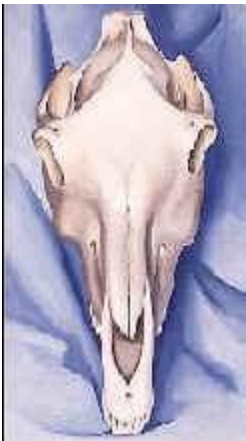
Horse's Skull on Blue, 1930 Oil on canvas, 30" x 16" Arizona University Art Museum