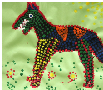
Toby Versluys, Gr. 3