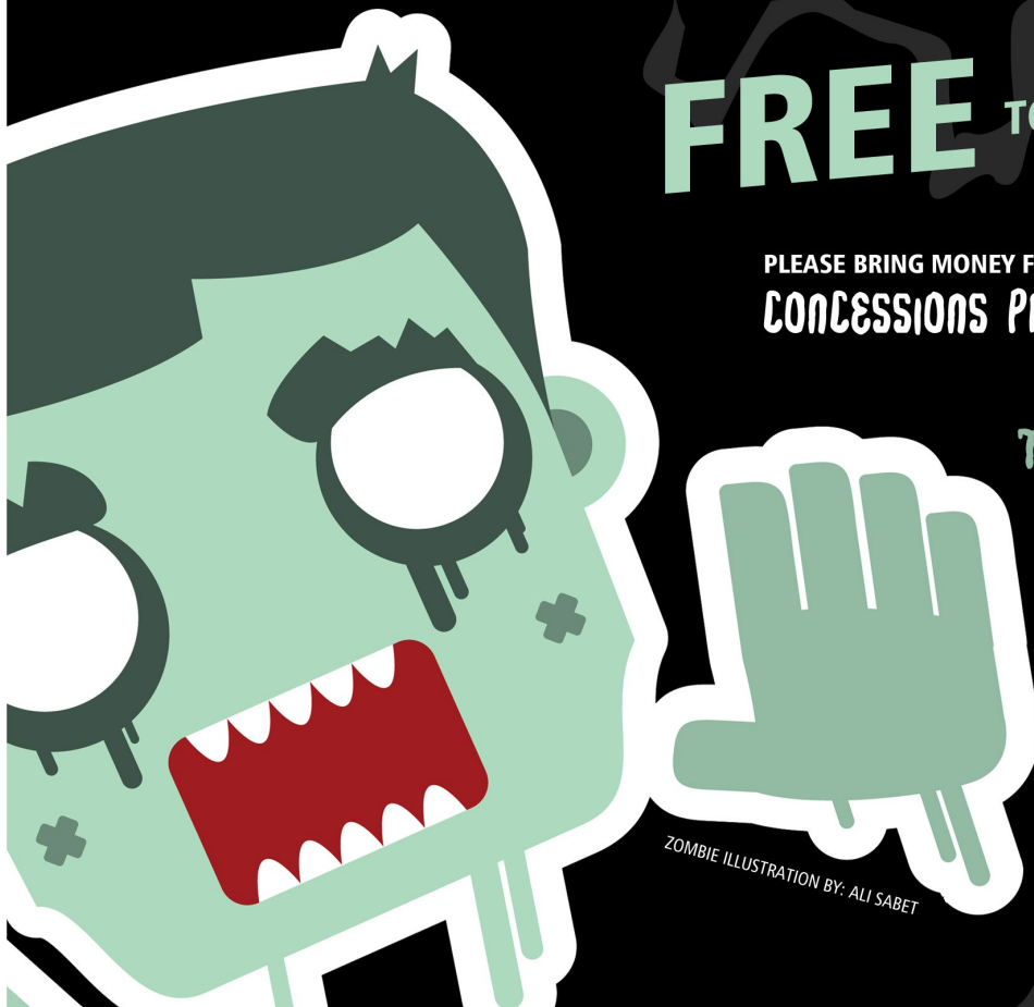
ZOMBIE ILLUSTRATION BY: ALI SABET