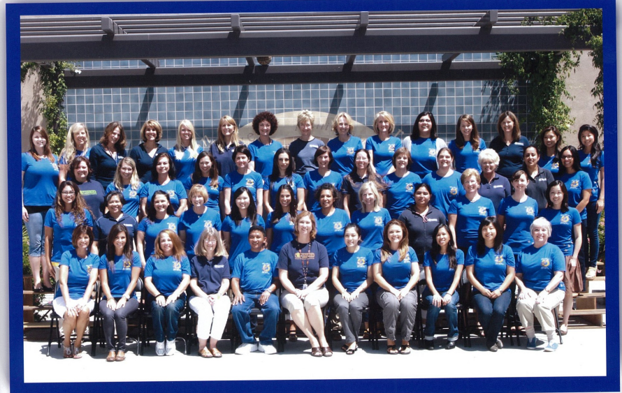
WOODBURY ELEMENTARY SCHOOL