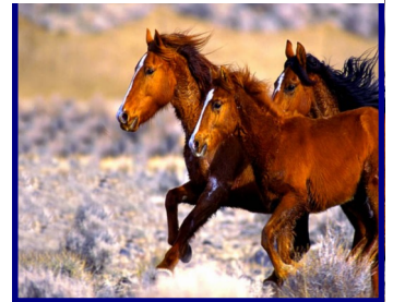
Wild Mustangs Running through

We look forward to a fantastic 2009-2010 school year.